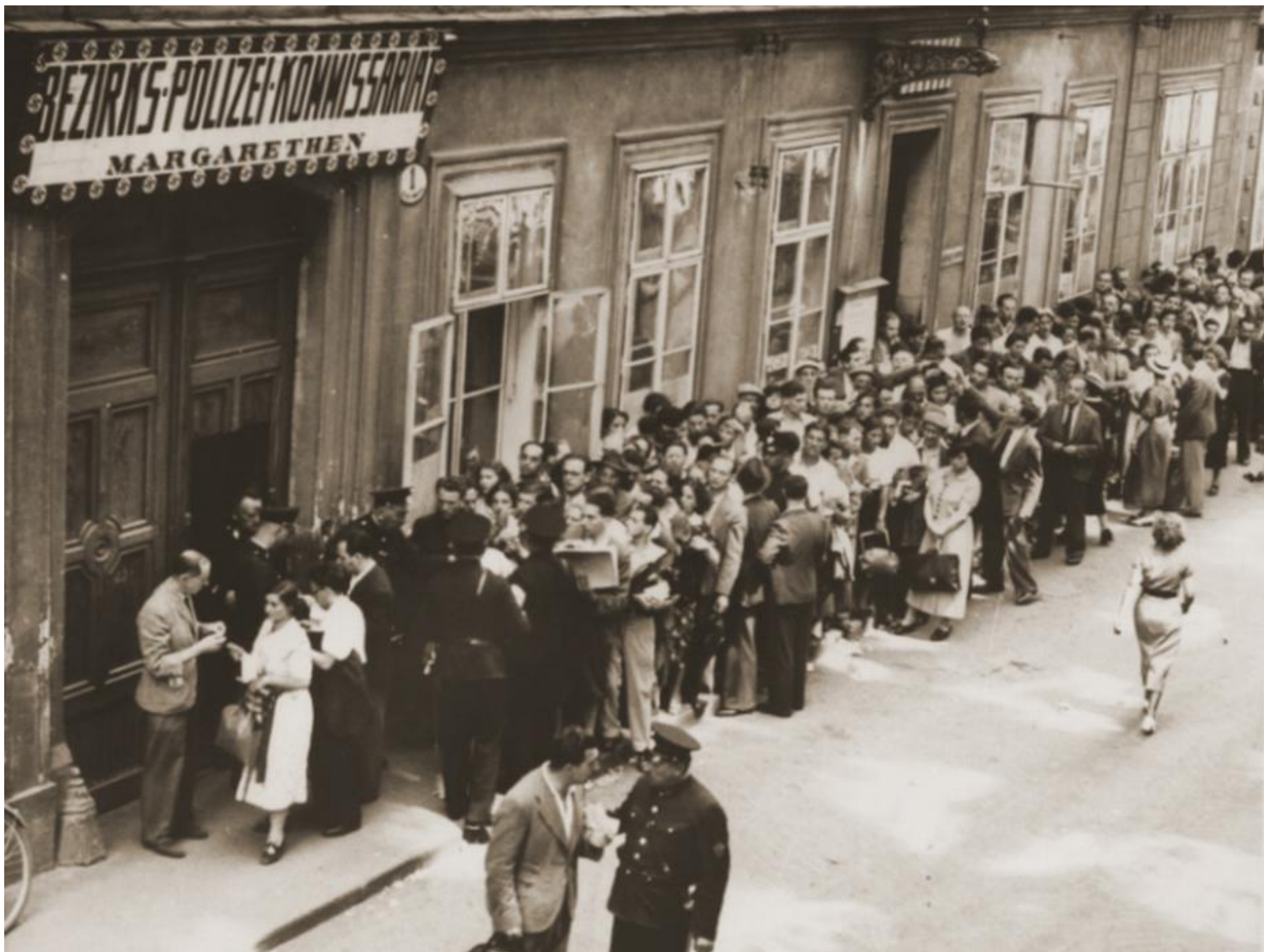
Jews hoping to receive exit visas at a police station in Vienna.

Eichmann and the "Office for Jewish Emigration"